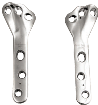
DT L CBLO 3.5 Right and Left